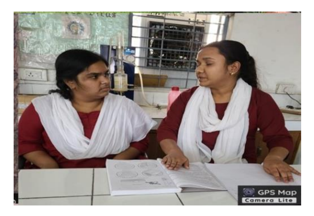
Slow and advance learner Method