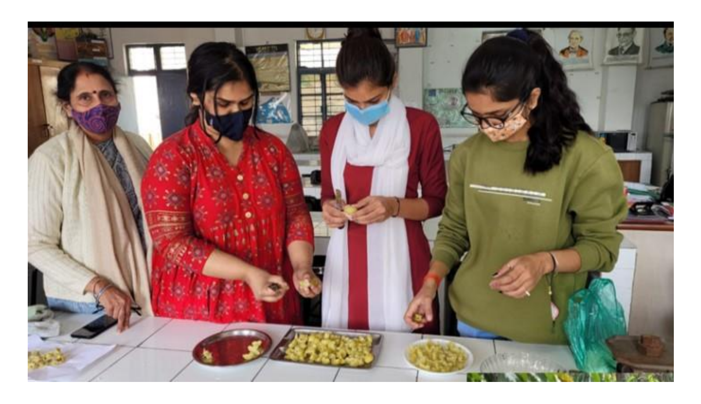
Preparation of Amla candies