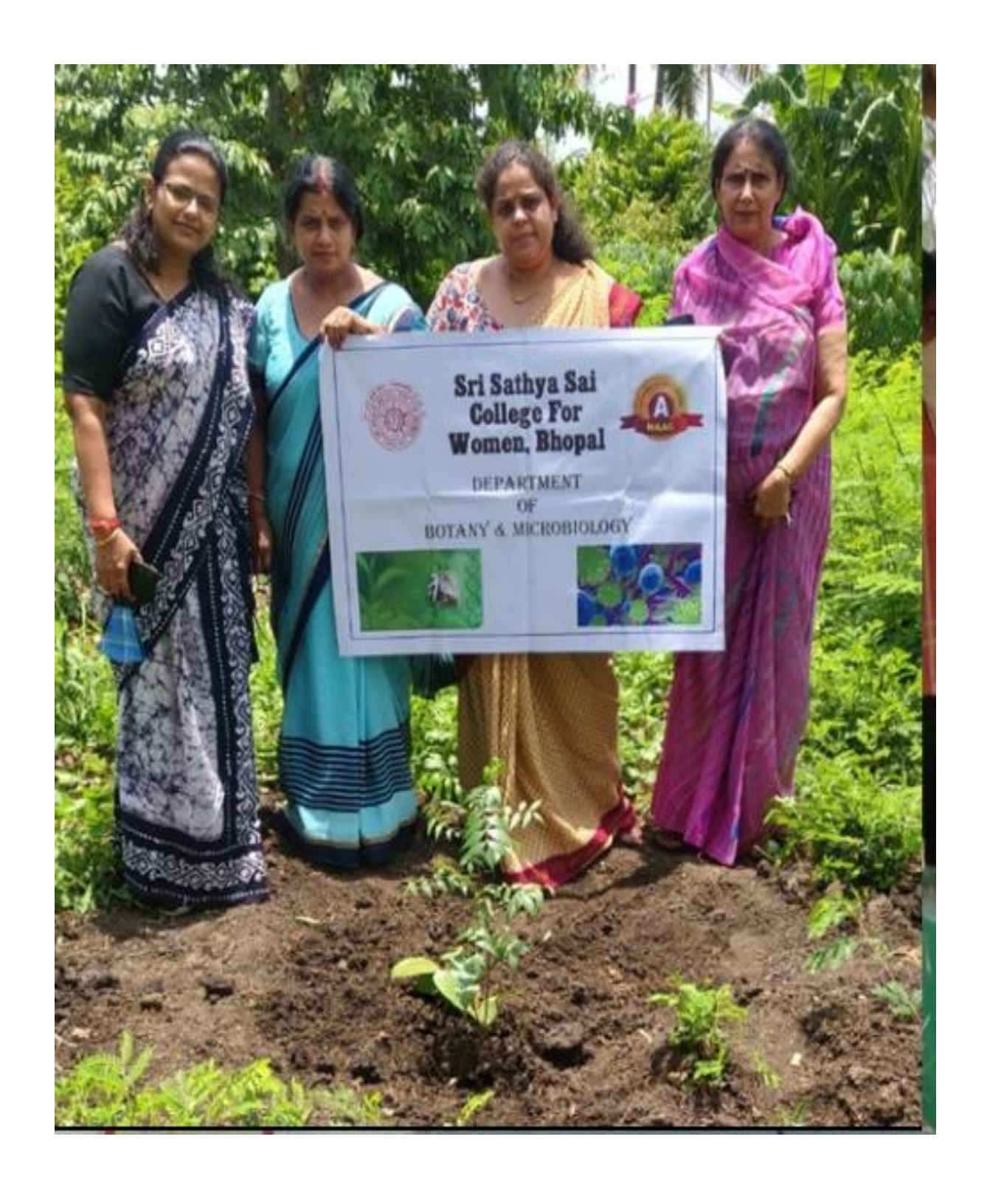
Tree plantation activity