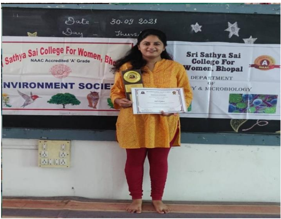
Best Microbiology Student Award given by Microbiology Society of India