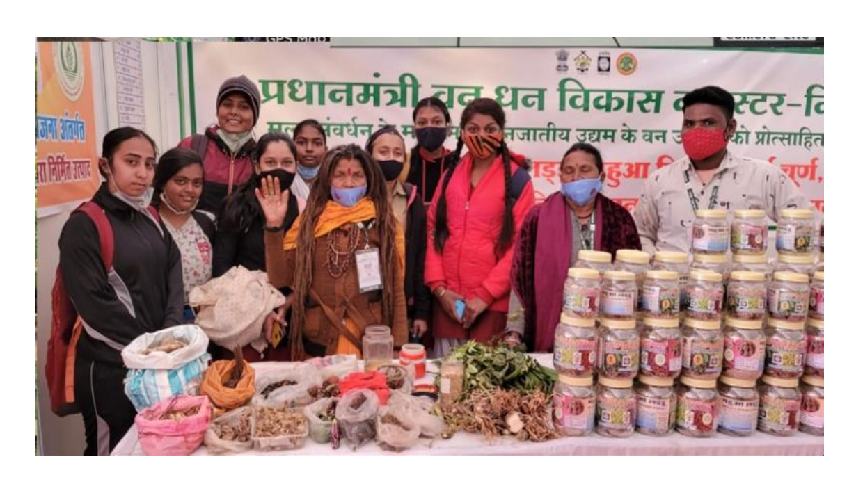
Visit to International Van Mela