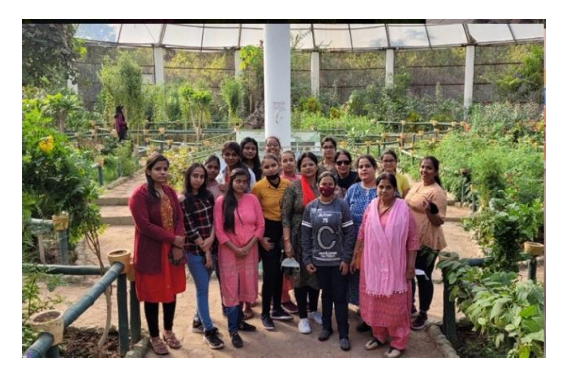
Picnic to Udaygiri caves, Butterfly Garden